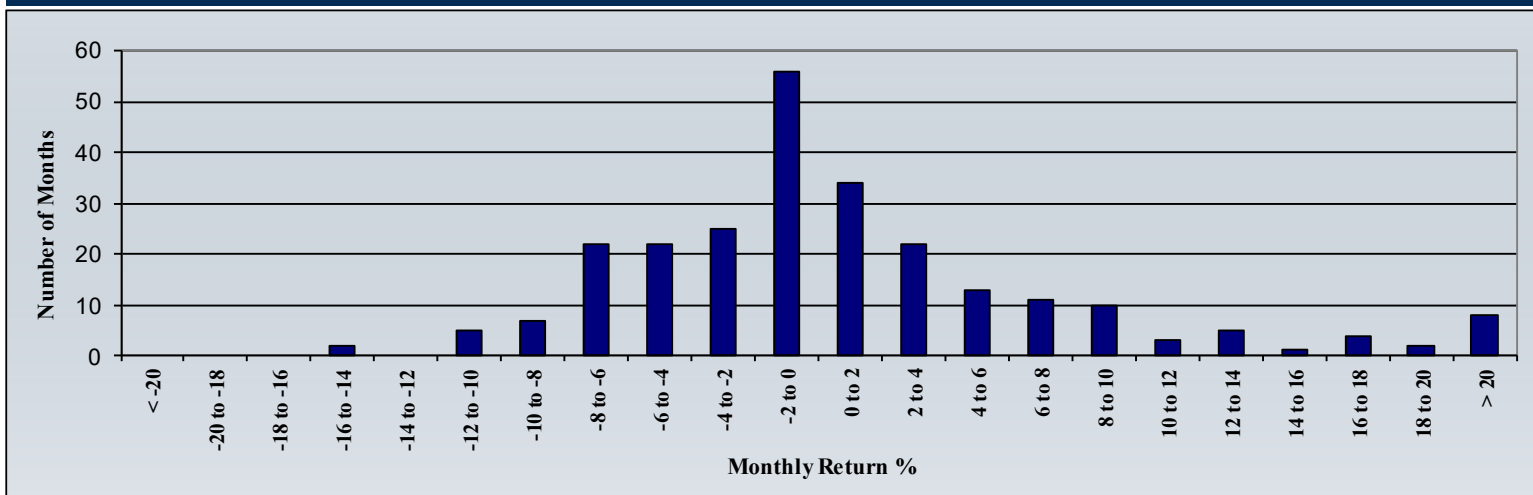
Monthly Returns Distribution

Past performance is not necessarily indicative of future results. No representation is being made that an account will achieve future profits and losses similar to those shown above. Futures trading involves substantial risk and is not suitable for everyone. Investing in the program should be considered only after a careful study of our most recent disclosure document, which is available on our website. This document is not intended to be an offer or a solicitation to invest.