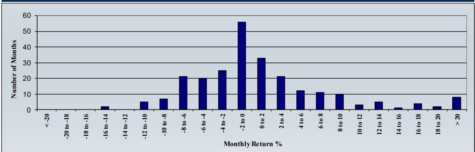
Monthly Returns Distribution

Past performance is not necessarily indicative of future results. No representation is being made that an account will achieve future profits and losses similar to those shown above. Futures trading involves substantial risk and is not suitable for everyone. Investing in the program should be considered only after a careful study of our most recent disclosure document, which is available on our website. This document is not intended to be an offer or a solicitation to invest.