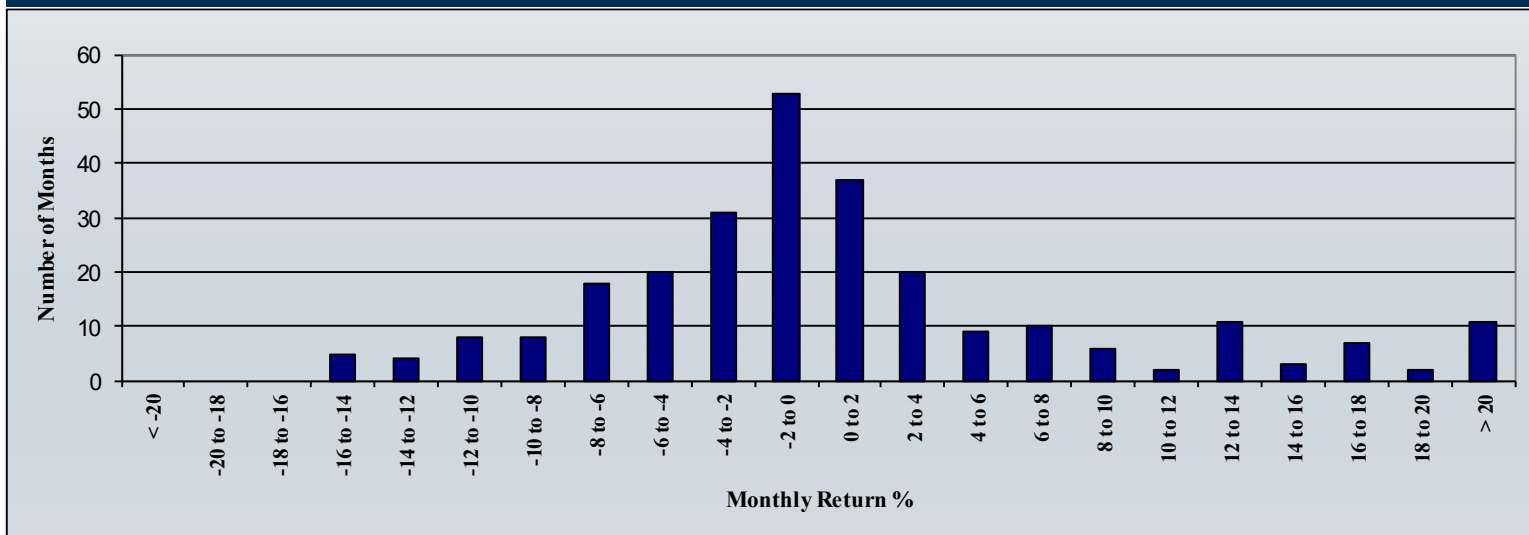
Monthly Returns Distribution

Past performance is not necessarily indicative of future results. No representation is being made that an account will achieve future profits and losses similar to those shown above. Futures trading involves substantial risk and is not suitable for everyone. Investing in the program should be considered only after a careful study of our most recent disclosure document, which is available on our website. This document is not intended to be an offer or a solicitation to invest.