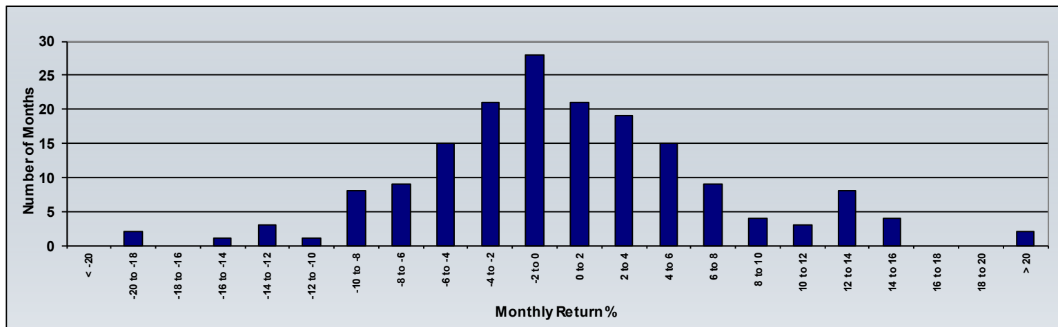
Monthly Returns Distribution

Past performance is not necessarily indicative of future results. No representation is being made that an account will achieve future profits and losses similar to those shown above. Futures trading involves substantial risk and is not suitable for everyone. Investing in the program should be considered only after a careful study of our most recent disclosure document, which is available on our website. This document is not intended to be an offer or a solicitation to invest.